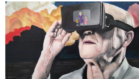
The Matrix by Brook Hunter

The fifth annual group exhibition by secondary schools from across the region.