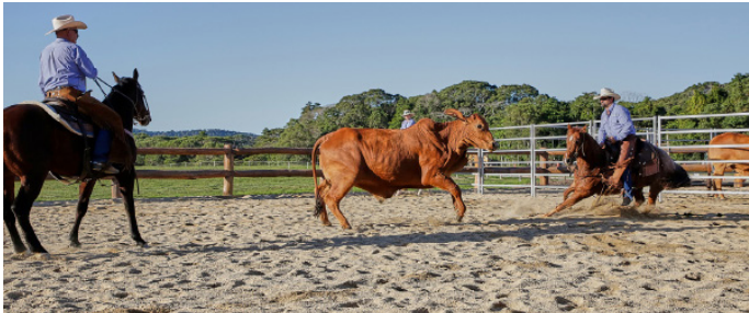
Cattle and Horse Show C5

Show time: Activities Duration : half or full day