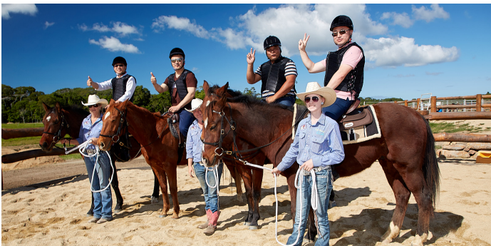
Horse Riding C4

Show time: Activities Duration : 30 mins or 1 hour