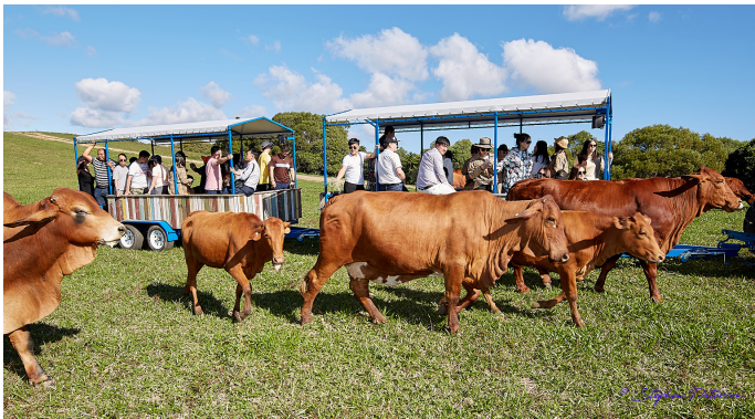
Hayride and Cattle E4

Show time: Activities Duration : 30 mins