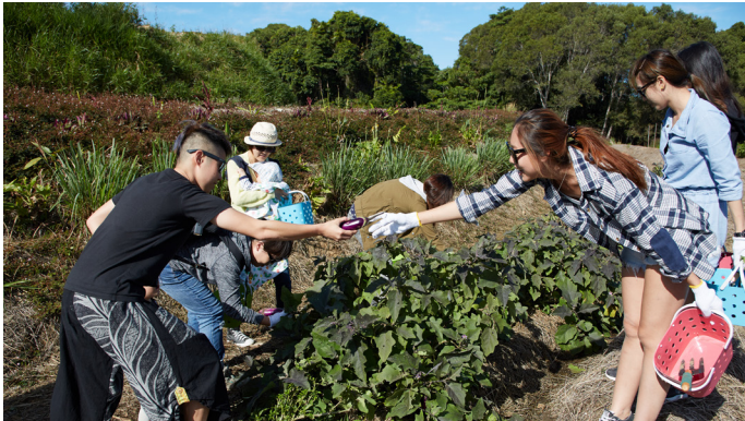
Accredited Organic Farm C5

Show time: Activities Duration : 0.5 hrs