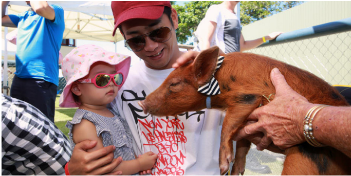
Mini Animal Farm C4

Show time: Activities Duration : half or full day