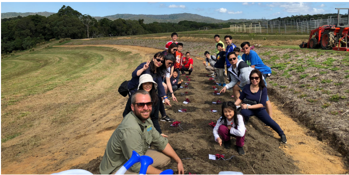
Tree Planting B6