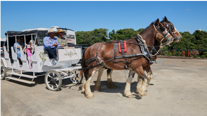
Carriage Ride B7

Show time: Activities Duration : 30 mins or 1 hour